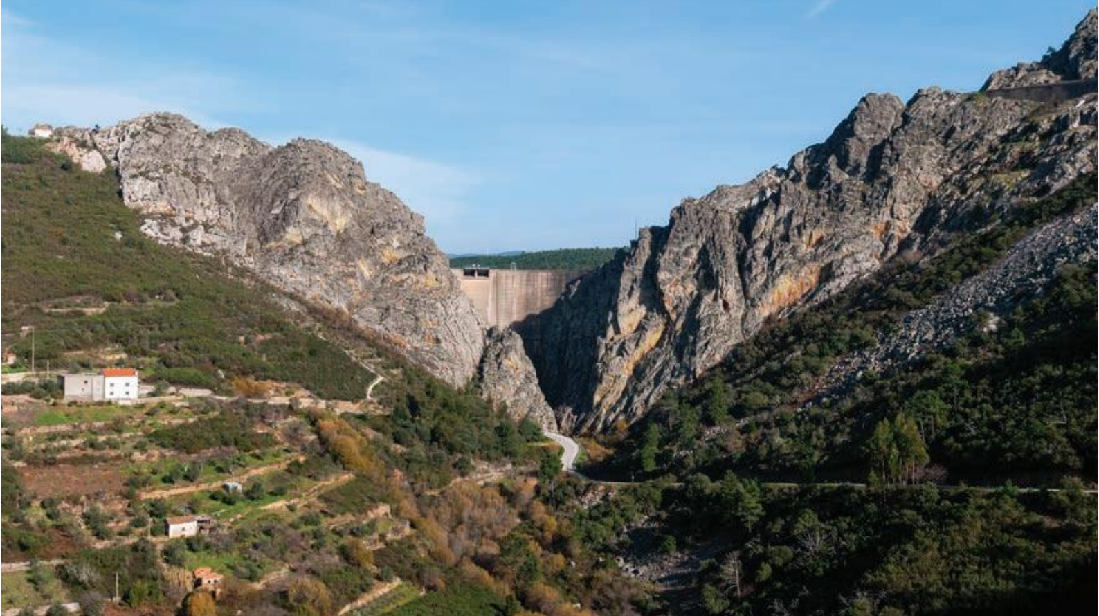
D - Santa Luzia Dam