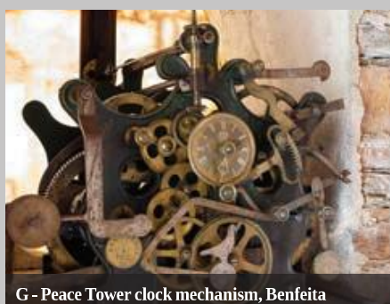
G - Peace Tower clock mechanism, Benfeita

With its forest of deciduous species and an abundance of evergreens, holly and Portuguese laurel, Margaraça Forest is one of Portugal's most important forested areas. It has an interpretation centre and walking trails. Enclosed in a narrow valley, Fraga da Pena [8], a 20m-high waterfall which cascades into the Degrainhos ravine, is another emblematic feature of this landscape.