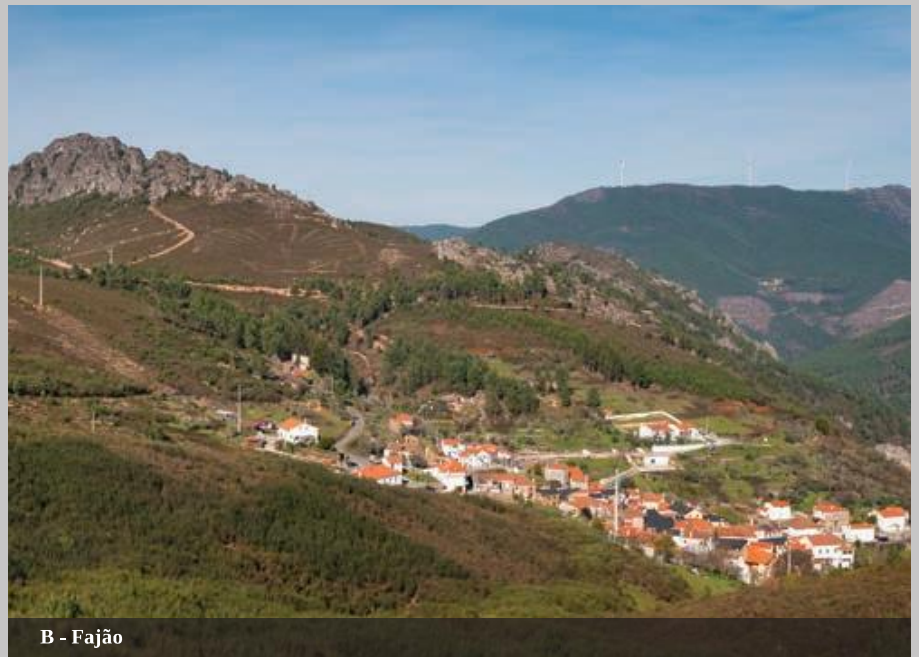
B - Fajão

A feat of engineering enabled a dam wall to be installed in a spectacular quartzite canyon in the River Unhais. It is possible to cross the crest of the dam to fully appreciate the rock formations. Not suitable for those who suffer from vertigo.