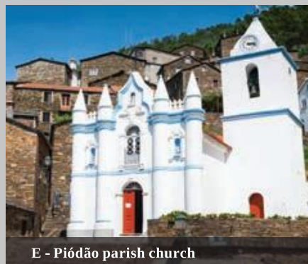
E - Piódão parish church

The Historic Villages of Portugal was the first network of villages to be created and Piodão quickly joined it. Although it has none of the significant monuments that typically characterise the villages in this network, Piodão is an excellent example of the construction and organisation of villages built from schist and happens to sit well alongside the 27 villages that make up the more recent Schist Villages Network. It has a tourist information office and a small museum.